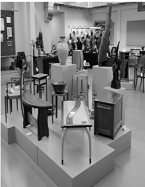
2023 Thanksgiving Show Floor entrance...